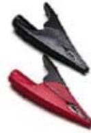
AC285-FL: Alligator Clips.