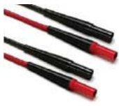
196-3523-00: Extender Leads (1.5 m).