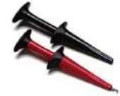
AC280-FL: Hook Clips.