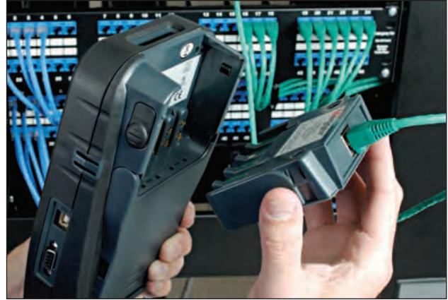
SCT Series adapter employs new "connector-less" adapter technology.

The SCT Series speeds the user through link diagnosis with powerful diagnostic tools found only on the Megger SCT. The instrument pinpoints the distance to link disturbances on each measured pair and displays this data in multiple helpful formats. After completing a certification test the user can choose to generate and display diagnostic results. Diagnostic wiremap displays the length to an open or short on each pair. Diagnostic TD NEXT and TD Return Loss measurements quickly and accurately calculate the distance to and the strength of all disturbances on each measured pair on a percentage scale, where values exceeding 100% are an indication of a link failure. Summary TD NEXT and TD Return Loss display the distance and strength of the single worst disturbance for pinpointing the worst fault. Detailed TD NEXT and TD Return Loss display the distance and strength of each pair's worst case disturbance for quickly pinpointing one or more faults. This is highly useful for confirming connector or cable failures. Graphic TD NEXT and TD Return Loss display every pairs disturbances vs. distance on a graph for pinpointing all possible faults. This is highly useful for diagnosing all possible link failures.