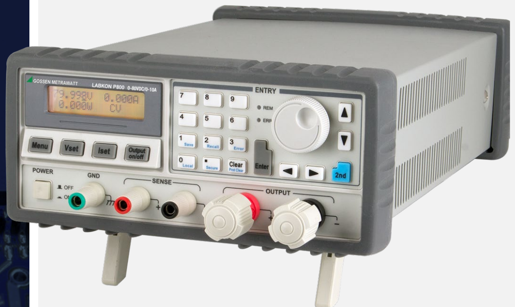
LABKON P SERIES DC POWER SUPPLIES

HIGHLY RELIABLE COMPUTER CONTROLLED POWER SUPPLIES