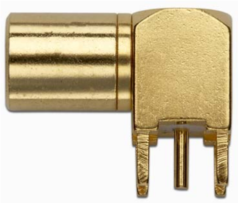
Model 72997 SMB PLUG R/A PCB RECEPTACLE