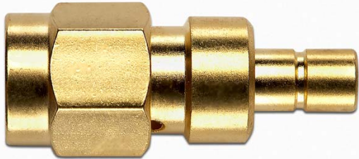
Model 72976 SMA (M) TO SMB (M)