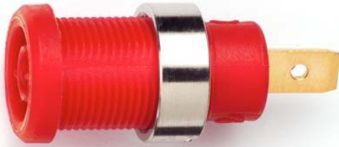
Model 72913 Panel Mount IEC61010 4mm (0.16in) Jack for Sheathed Banana Plugs