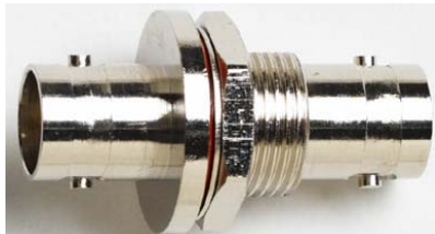
6744 BNC (F/F) Panel Mount Hermetically Sealed-75 Ω