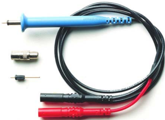
Model 6106 DMM RF Detector Test Probe